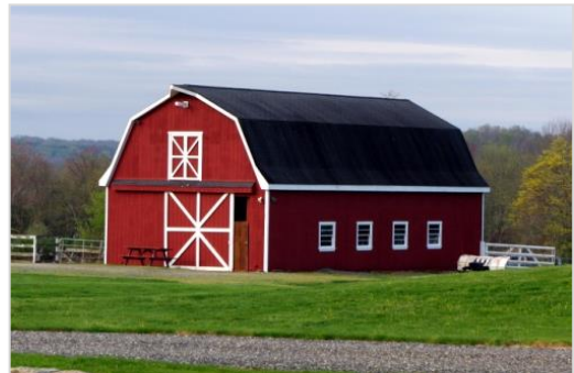
20 th Century Vernacular Barns

Barn and farm buildings are utilitarian in nature, usually lacking the stylistic details of domestic architecture. What they lack in detail they often make up in graceful proportions and a simple graceful aesthetic. Older barns are generally timber framed, often with vertical sheathing. “English” barns used throughout the 17 th and 18 th centuries have their main entrance on side gable walls and lower-pitched roofs. Windows were rare in barns of this type.